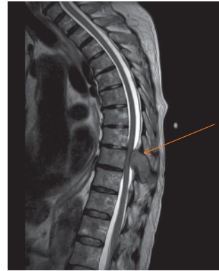
Figure 4 Tumour in the spine