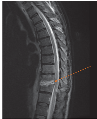
Figure 3 Spine infection