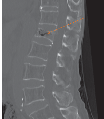
Figure 2 Spine fracture