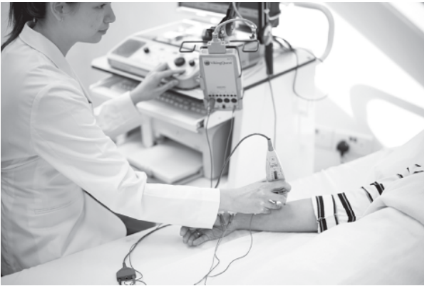
Image 1 Nerve Conduction Study