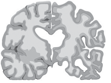
Figure 1 Left - Normal Right - Dementia Shrinkage of the brain in Dementia patients

A Magnetic Resonance Imaging (MRI) or Computed Tomography (CT) scan looks for a treatable cause of dementia or the presence of atrophy (shrinkage) in the brain (Figure 1). A Positron Emission Tomography (PET) scan can also confirm the presence of amyloid and tau pathology.